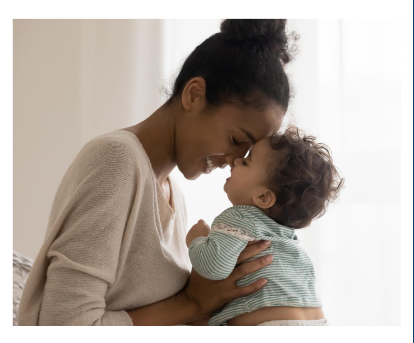
Advancing Healthy Births (michigan.gov)

Advancing Healthy Births: An Equity Plan for Michigan Families and Communities is a next step in working towards an equitable Michigan and requires action from all of us.